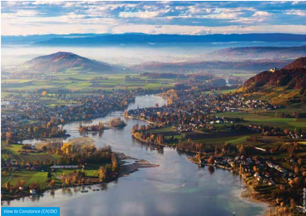
View to Constance (CH/DE)